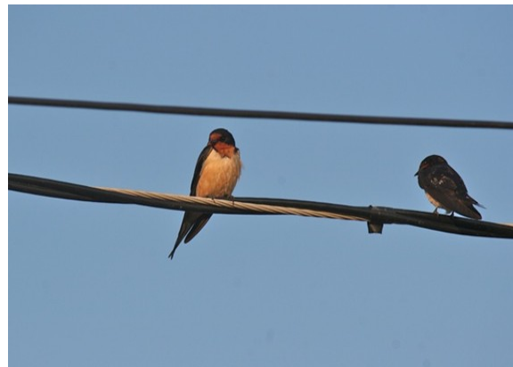
Barn Swallows.