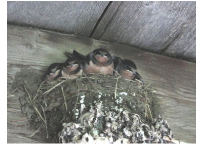
Barn Swallow chicks.

Much to her surprise, she found several of the woodshed fledglings piled into the barn nest. What we see in the photo are four nestlings in the barn, joined by three fledglings from the woodshed!