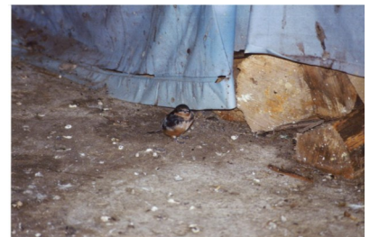
"Quick, mom, let's get out of here! I think I saw a pussycat!"