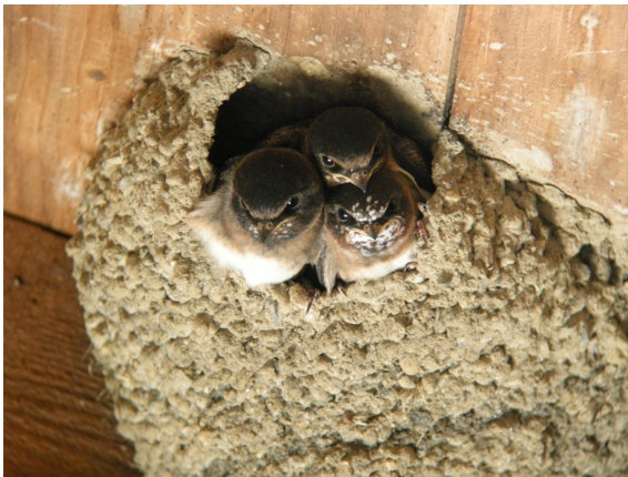
Cliff Swallow nest (top) under the portico at Fort Constitution (below) in New Castle.

One area that may cause problems is the “Latitude” and “Longitude”. If you can’t find these coordinates, just provide a good description of where the colony is located. We use the coordinates to find the site on a Google Earth map and a good description or a photo copy of a map with an “x” marks the spot works just as well. We can also get the coordinates from the physical address of the site, which should always be provided.