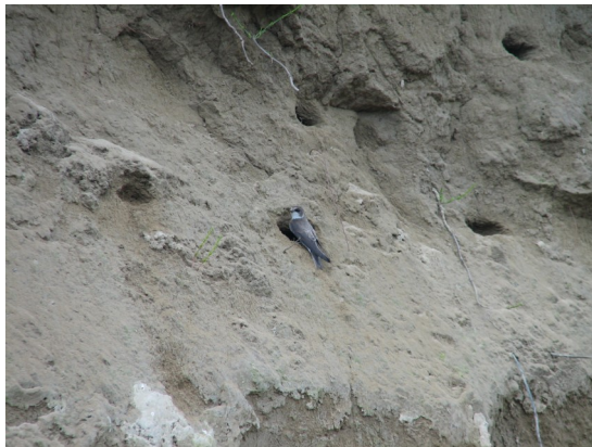
Bank Swallow adult.

The NH Swallow Colony Registry (Swallow CORE) is a statewide citizen science initiative. We have just completed the second swallow breeding season (summer 2012), during which volunteers observed and collected data on swallow nesting sites across New Hampshire. As a reminder, four species of swallow are included in this project: Bank Swallow, Barn Swallow, Cliff Swallow, and Purple Martin.