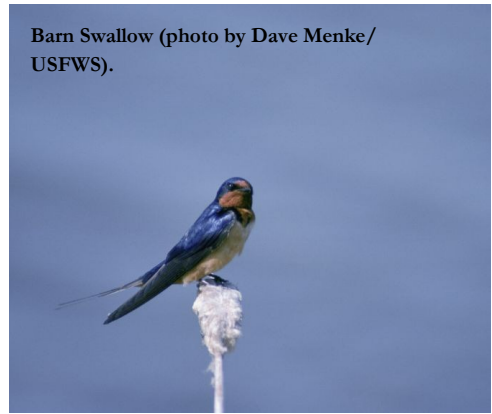
Barn Swallow.